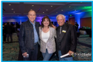
Ready for a Great Night!